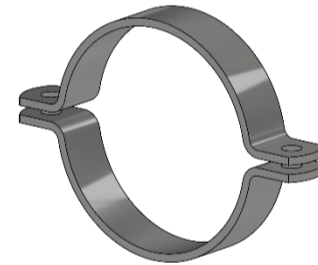
Galvaniseret Hot-dip galvanized