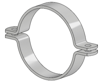
Rustfri AISI 304L/316L Stainless AISI 304L/316L